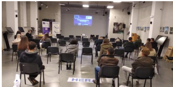
Training for Election day observers in the City of Mostar

On Election day, Pod lupom covered all polling stations in the City of Mostar.