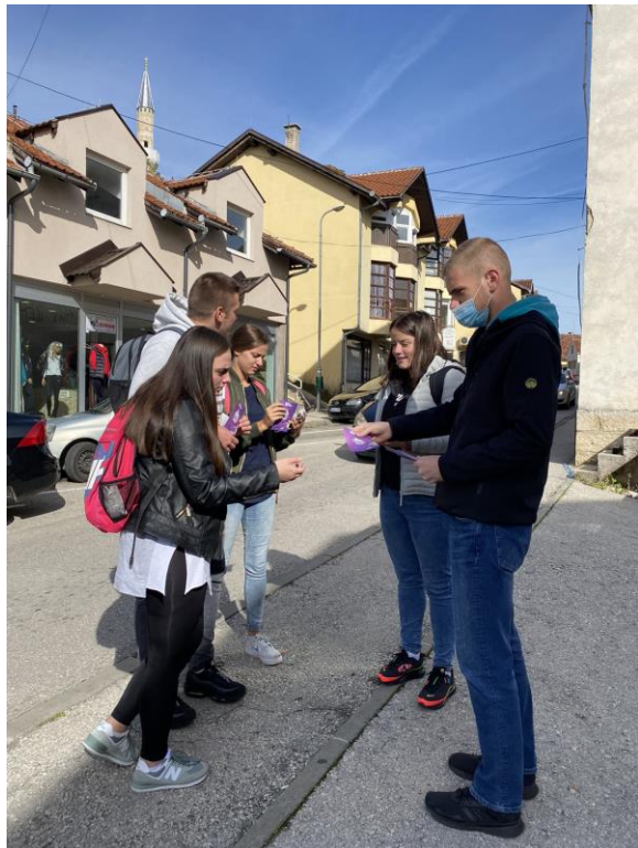
Mrkonjić Grad (October 9, 2020)

Pod lupom and civil society organizations organized 37 street actions across the country to mobilize Election day observers.