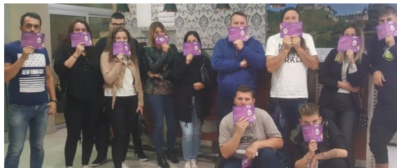
Bosanska Krupa (October 6, 2020)