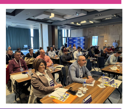
Assembly of Pod Lupom Coalition Tarčin, February 4-6, 2025.

The second regular Assembly of Coalition for Free and Fair Elections Pod Lupom, consisting of representatives from 40 civil society organizations across Bosnia and Herzegovina, was held. At the Assembly, 19 full member organizations of Pod Lupom Coalition were voted in, and two new organizations were elected to join the Coalition's Strategic Board. This marks the first expansion of full members since the Coalition's establishment in 2014.