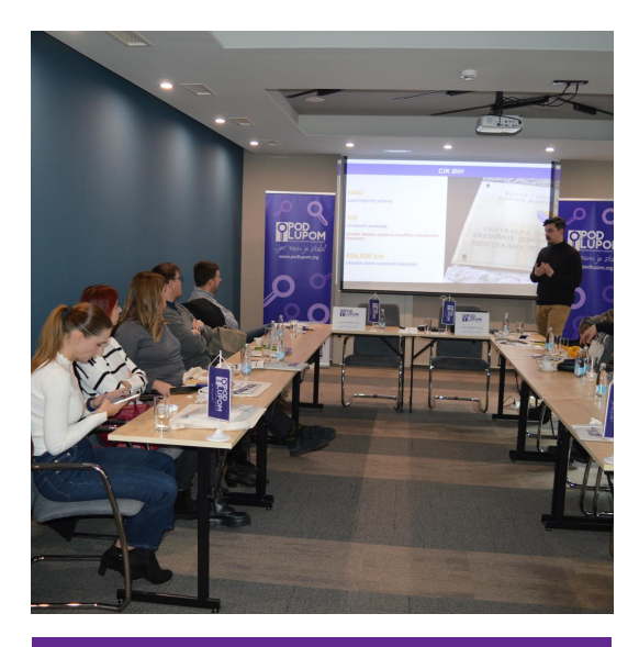
Media Briefing Mostar, January 24, 2025.

At the briefings organized by Pod Lupom Coalition, aimed at presenting the key findings from the observation of the 2024 Local Elections and recommendations for improving the electoral process, 22 media outlets and 29 representatives (journalists and editors) participated.