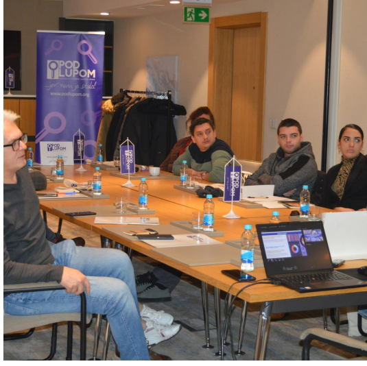
Media Briefing Banja Luka, January 22, 2025.