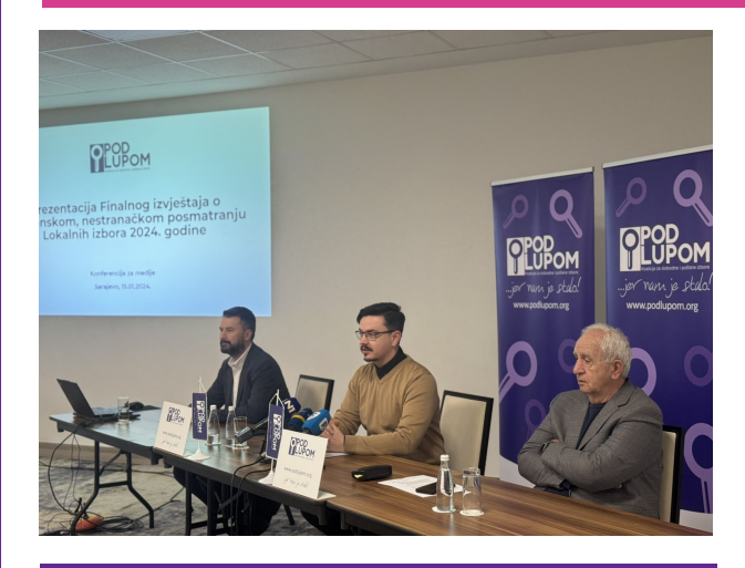
Final Report Presentation Sarajevo, January 15, 2025.

Pod Lupom Coalition has presented the Final Report on citizen-based, non-partisan observation of the 2024 Local Elections. The report provides an overview of the pre-election period, election day, and post-election period, analyzing key processes and offering recommendations for improving the electoral process.